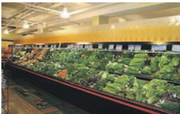
Mainstream national retailers and specialty chains such as The Big Carrot (above) are playing an expanding role in the organics movement.

Today, the biggest movers of organic products are the mainstream national retailers, who are responsible for over 40 per cent of Canada's $2-billion annual organic market.