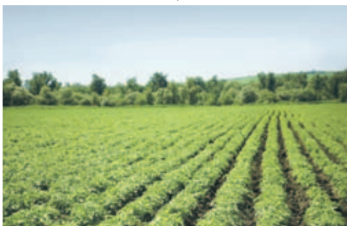
Organic growers are calling for a national action plan to help more farmers make the switch to organic agricultural methods.

Never has there been a greater opportunity for wide-scale change; Canadian consumers are demanding greater accountability in the food system, there is a pressing need to reduce the environmental footprint of agriculture, and our food security depends on stemming the loss of farmers.